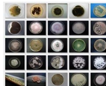
Figure 2. Bioactivity testing of fatty acid derivatives